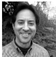
V l q f h u o j / Z l a #z d o h u w F k d l v #v l u u d #F o x e #U r f n | #P r x q w l q #k d s w h u

S I V #S d d v h #k d u h #k l v #p s r u w d q w #v x h #z l k #| r x u #i l h g v #i d p l c | #i q a #f r a n d j x h v l